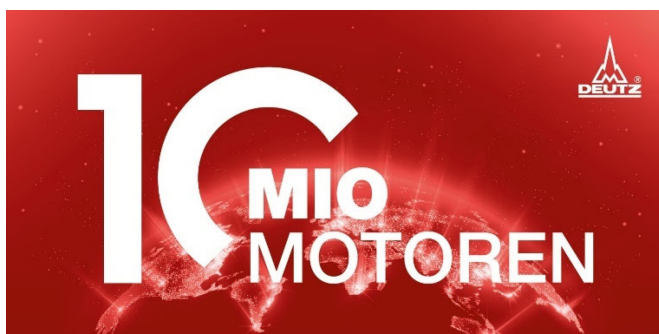
Caption: DEUTZ celebrates 10 million engines produced.